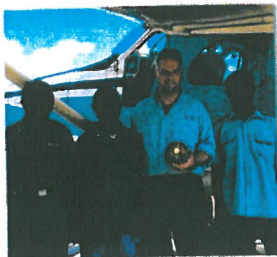
RECEIVING A GIFT OF THANKS